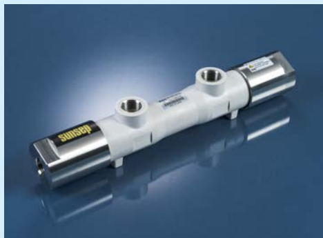
Bar shaped module : High flow rate up to 1m 3 /min