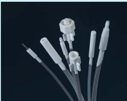
SWT series : Suitable for low flow rate gases