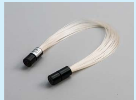
Custom-made products : We'd be happy to hear your requirements