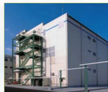
cGMP plant, Chiba

AGC's Chiba plant is registered to ISO 14001.