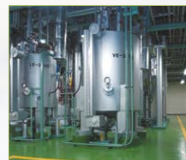
cGMP plant reactors