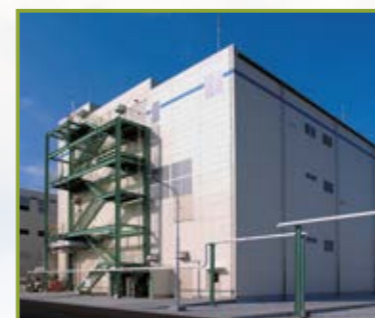
cGMP plant, Chiba

AGC's Chiba plant is registered to ISO 14001.