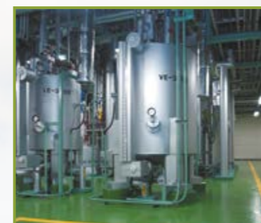
cGMP plant reactors